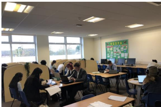
The new Sixth Form Library room

Year 13 have been helping to make positive change in the 6 th form area by turning the silent study area into a library to make it a more relaxing and productive environment. On Monday students listened to an assembly on LGBTQ+ month where we discussed visibility within the community. On Tuesday, the up for discussion was on the changes made to Roald Dahl's books. On Wednesday the first 'Well-being Wednesday' which was a huge success. Students took part in Origami, mindfulness colouring, basketball, table tennis, Gaslands (a tabletop post-apocalyptic car game) and just dance. On Thursday many Y13 students came in to complete their coursework during the strike day and on Friday it was Mock The Week, a weekly quiz summarising the news of the week.